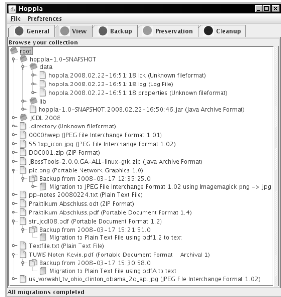
Figure 2: Screenshot of File Browser in Hoppla

The Hoppla system provides reports about archiving processes including statistics of backed up objects, successful