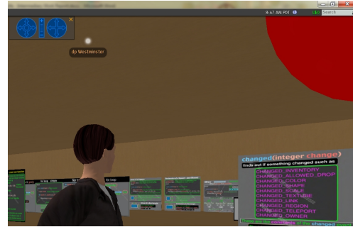
Figure 1: Recording camera, integrated with the Second Life HUD

the existence of a select virtual world, often events related to closure or end. A proposal for automatically filming scenes in SecondLife, which is similar to the approach presented in this paper, was presented by Mohr [6]. Academic projects have also been started in collaboration with Linden Labs, aiming at a standardized and expandable process in virtual world archiving. An important deliverable of the “Preserving Virtual Worlds” project [1] is the definition of a metadata standard aimed specifically at archiving virtual worlds, allowing for the creation of a specialized ontology which would greatly help with accurate representation of preserved information, especially with regard to later evaluation and querying.