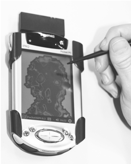
Figure 3. Mozart's complete works displayed in i-PocketSOM running on a PDA.

the intuitive selection of regions of similar songs.