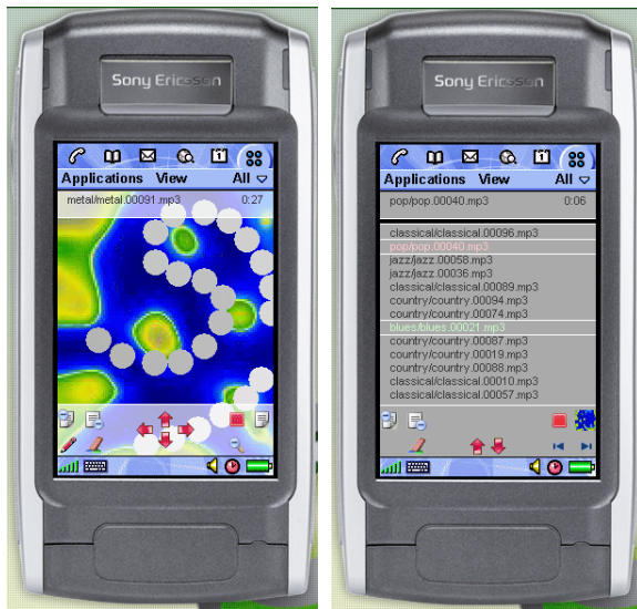
(a) Zooming enabled (b) Playlist editing on the mobile m-PocketSOM .