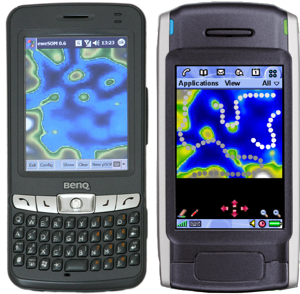
(a) e-PocketSOM application run- (b) m-PocketSOM on a Sony-ning on a BenQ P50 smartphone. Ericsson mobile phone.