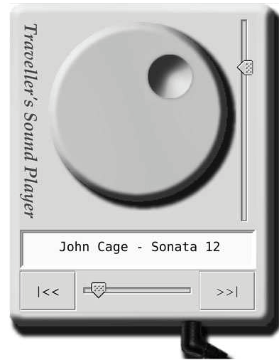
Figure 1: A screenshot of our Java applet “Traveller’s Sound Player”.

In this paper, we present an extension to the “wheel”. While the original approach involves the calculation of acoustic similarities between every pair of songs in a collection,